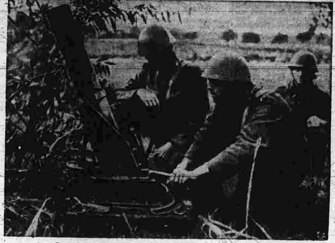
Czech Soldiers Operate a "Minie-Werfer" Near the German Border.