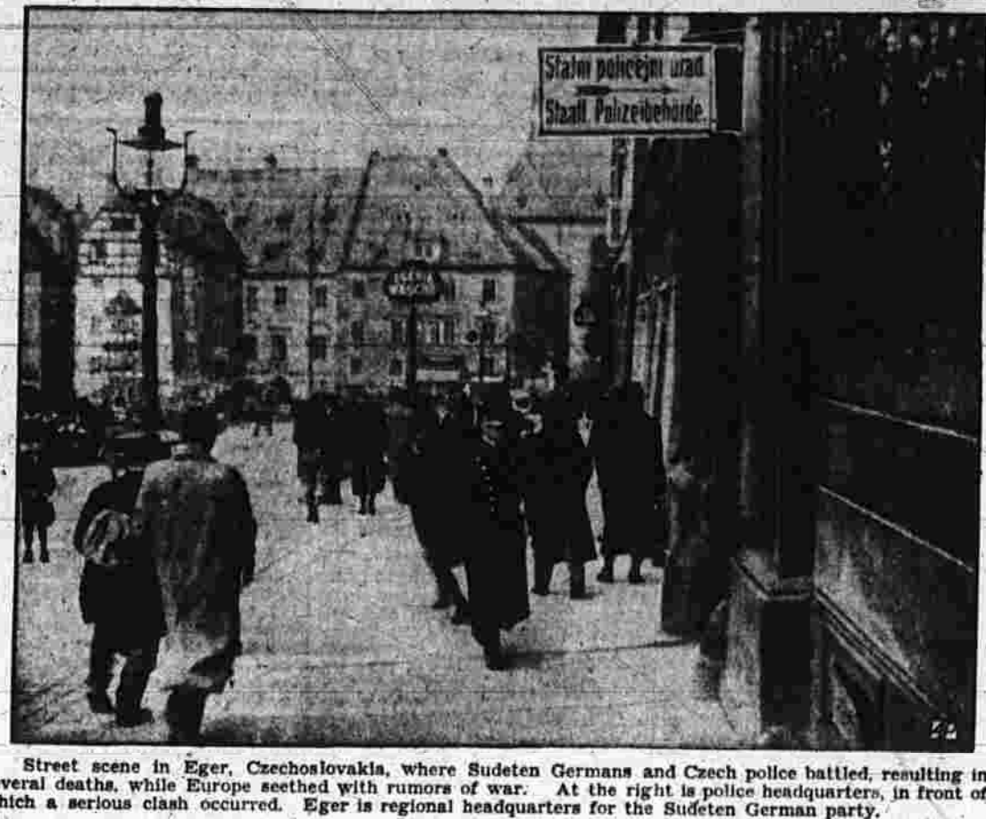
Street scene in Eger, Czechoslovakia, where Sudeten Germans and Czech police clashed, resulting in several deaths, while Europe seethed with rumors of war. At the right is regional headquarters for the Sudeten German party.